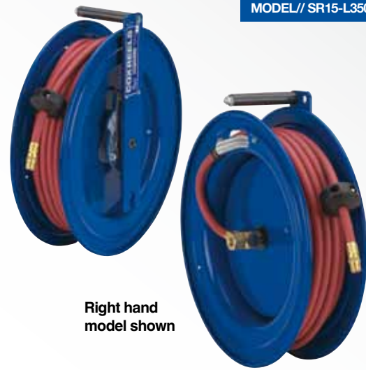
Right hand model shown